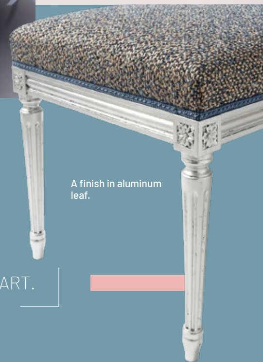
A finish in aluminum leaf.