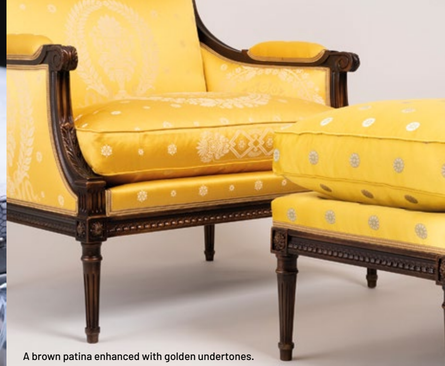
A brown patina enhanced with golden undertones.