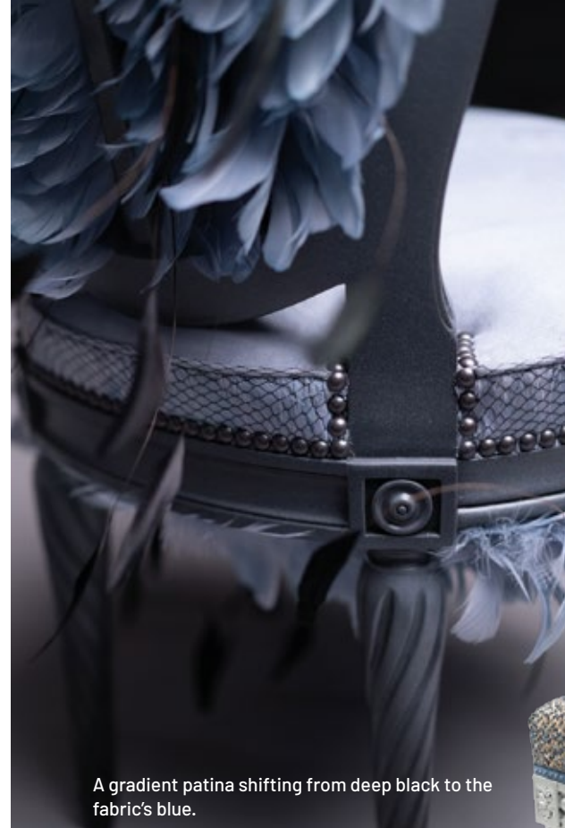
A gradient patina shifting from deep black to the fabric's blue.

B eyond aesthetics, every finish reflects artisanal excellence and the mastery of craft. The result of meticulous work, each seat is conceived with the utmost attention to detail, blending refinement with functionality. Delicate patinas, deep lacquers, applications of gold, copper, or aluminum leaf... Each of these techniques is interpreted in either a classic or boldly contemporary expression, enhancing every creation and revealing the perfect balance, in harmony with your vision.